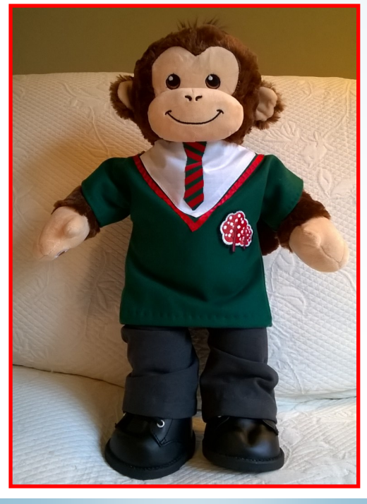
COPA's Attendance Chimp awarded termly to the class with the highest attendance!